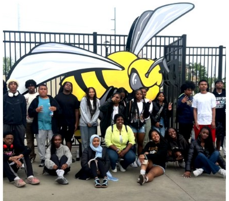
HBCU college tour group